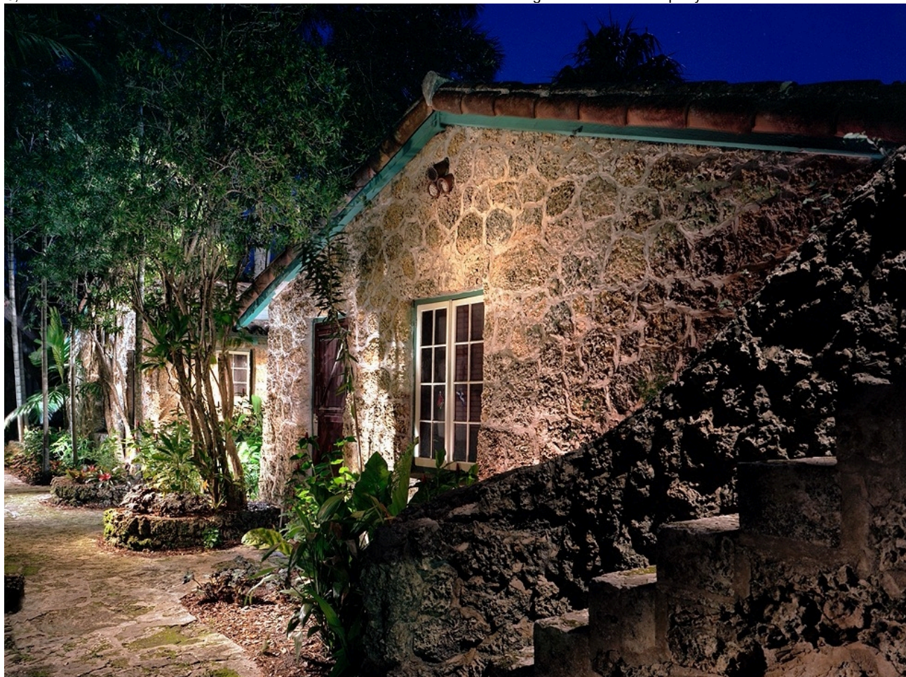
Coral Rock Village view

Miami, FL - December 22, 2025 - Miami is redefining the meaning of luxury real estate, and it's happening in a way that goes beyond conventional expectations.