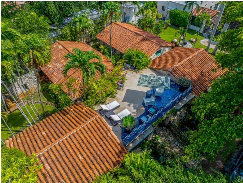
Coral Rock Village a Living Heritage Art Project where art and architecture are inseparable by Gladys Margarita Diaz