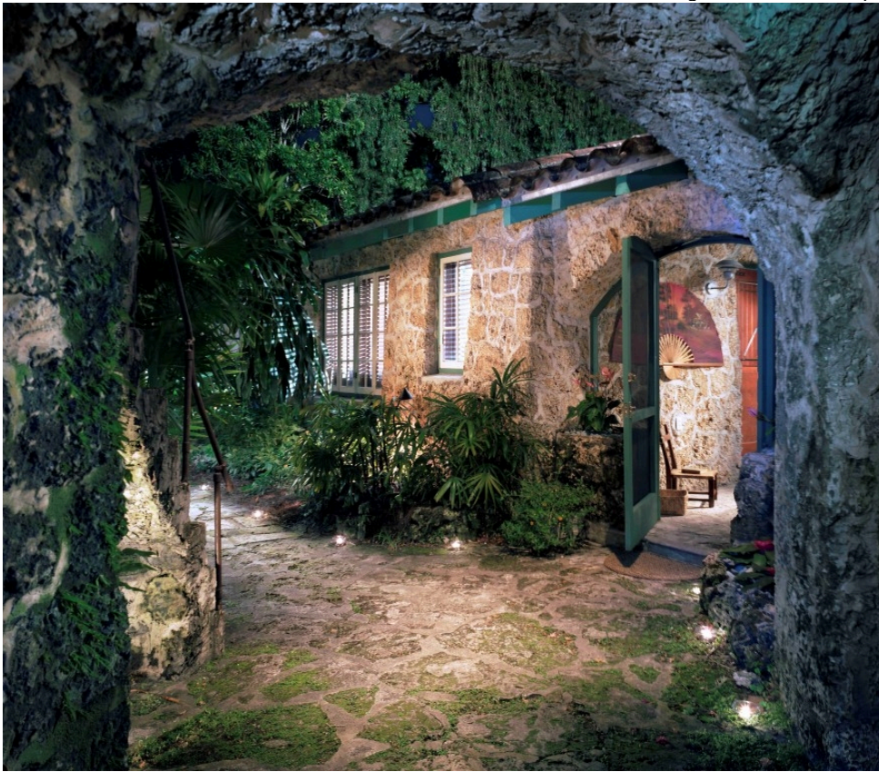
Coral Rock Village a Living Heritage Art Project where art and architecture are inseparable by Gladys Margarita Diaz